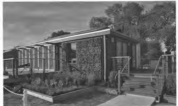
The LEAF House, new home of the Potomac Valley Chapter of the AIA

The tour is free and registration is not necessary. One AIA/CES HSW SD learning unit is available for the tour. LEAF House is located at 3907 Metzert Road, College Park, MD 20740.