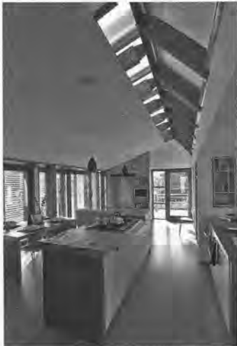
The LEAF House, University of Maryland's winning design from the 2007 Decathlon