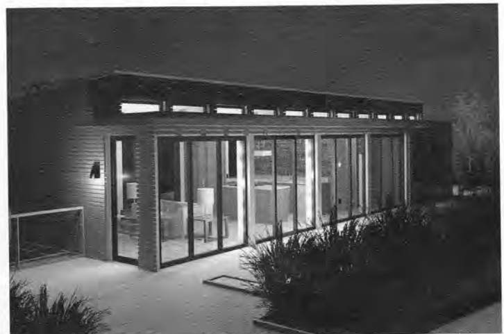
Rendering of Penn State's 2009 Solar Decathlon House

Penn State students are focusing on integration with the beauty and efficiency of nature to earn points in the decathlon. Their "Natural Fusion" entry incorporates a folding wall system with passive and active shading devices, a green roof, and one exterior and two interior "living walls" covered in plants as a way to cool surfaces, ventilate the air and enhance the residence.